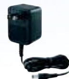
AC Adaptor (optional)