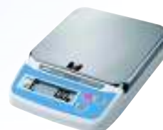
Stainless Steel Pan (optional)

Options Stainless steel pan (HT-10) AC adaptor